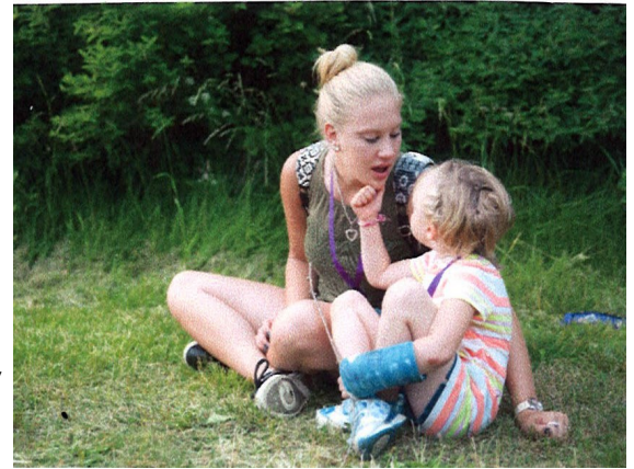
Royal Family camp organizer with a camp participant

Royal Family Kids Camp used this grant to send children in foster care to a week-long summer camp. These children were also thrown a collective birthday celebration with food and presents, as many of these children do not know when their birthdays are.