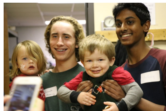
YAR members with ELCA participants