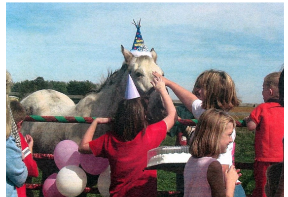
Cameo at his birthday party

The Midwest Therapeutic Riding Program utilized YAR funds to host a 30th birthday party for their very first therapy horse, Cameo, who has been a very important horse in the lives of many children with special needs. Cameo has been featured on a TV show and has won PATH Therapy Horse of the Year. The birthday party incorporated crafts and games that helped participants to work on fine and gross motor skills, as well as social skills.