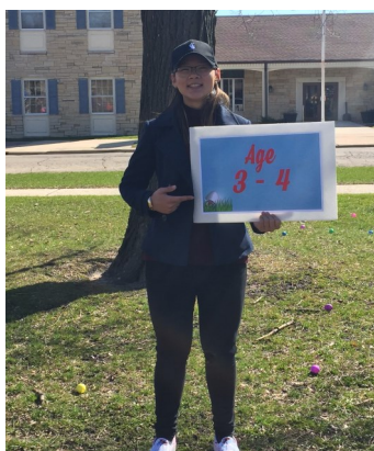
Helping with signage