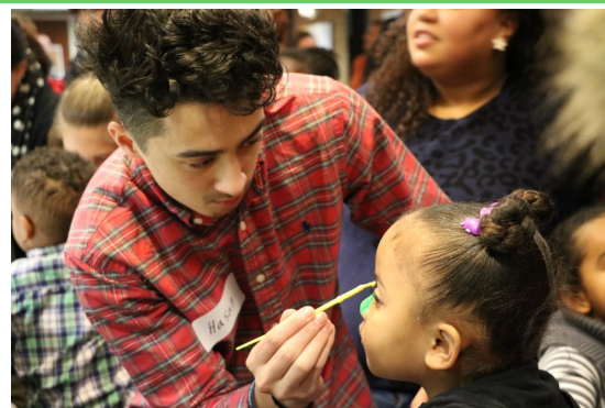
YAR board member painting children's faces at ELCA

The second service project that YAR members participated in was an Easter Bunny Hop. This is an all day event that begins in downtown Kenosha and includes an Easter egg hunt at Library Park.