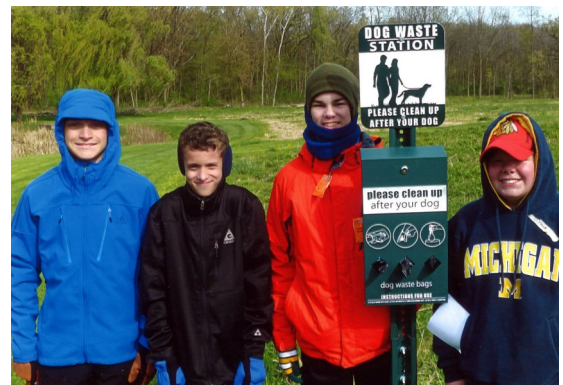
Dog waste stations were installed by the confirmation group from Lord of Life Church

The Randall Junior Optimist Club used grant funds to send a Kenosha County veteran on an honor flight to Washington D.C. They also created and purchased flowers, balloons, and signs to welcome the Kenosha County veteran.