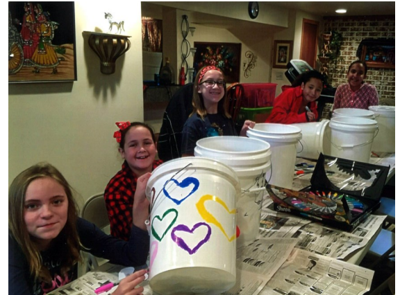
Girl scouts hard at work on bucket

Members of the Jacob Moss Eagle Scouts used grant funds to build a fishing pier and a ramp to connect the pier to the beach at Old Settler's Park.