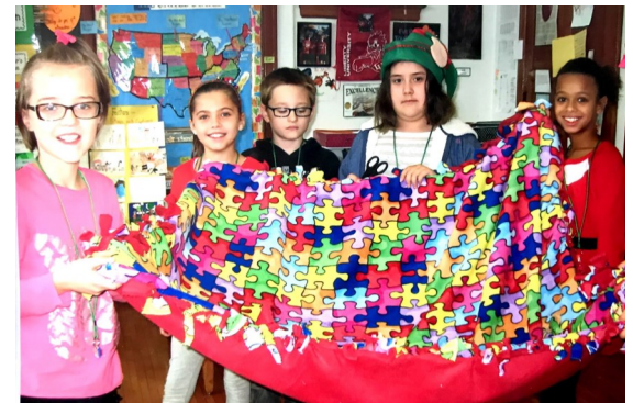
Peace Keepers showing off their hand made quilts

Grant recipients at Reuther Central High School utilized YAR funds to raise bullying awareness and teach prevention education to middle school students across Kenosha County.