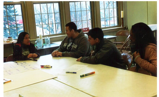
Lesson plan development

Leadership Team members developed their own lesson plans, practiced, and eventually presented to 7th graders at Mahone Middle School.