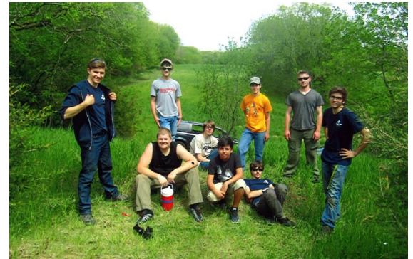
Boy scouts working on KD Trail markers

Boy scouts from Troop 505 cleaned a trail and put up trail markers at KD Park in Western Kenosha County. They cleared a 1/5 mile trail that will eventually connect the Eastern part of KD Park with the newly acquired Western section of the park. They also purchased and installed 21 fiberglass trail markers that were posted at all trail intersections at KD Park. These trail markers give directions and usage for each trail.