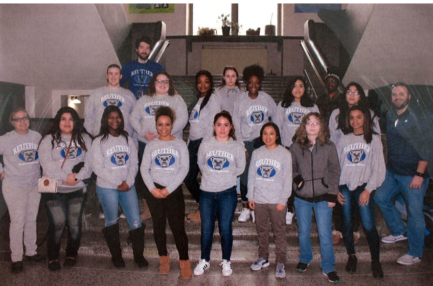
Reuther Central High School Leadership Team