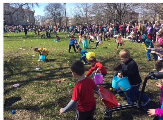
Kids participating in the Bunny Hop

For more information about Kenosha County Youth As Resources contact: