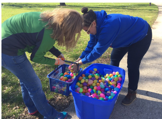
YAR members sorting eggs