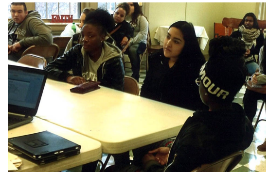
Leadership team members practicing their lessons