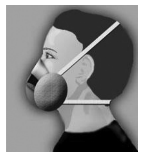
Wear an N95 or better respirator to reduce your exposure to mold spores disturbed during cleanup.

A flood-damaged building requires special attention to avoid or correct a mold explosion. Molds produce spores spread easily through the air, and they form new mold growths (colonies) when they find the right conditions: moisture, nutrients (nearly anything organic) and a place to grow.