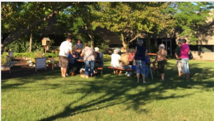
MGVs creating memory book pages at the Kenosha County Center.