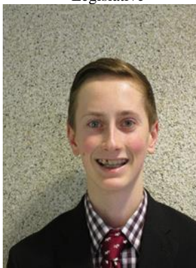
Alexander Dawson Public Works & Facilities