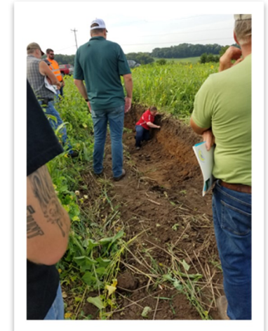
Soil Pit Demonstration at the WPCR Summer Field Day

On September 11 th , the WPCR hosted a field day at the Beck Grain Farm in Waterford. The field day included three sites to learn about soil health. The first was a soil pit to show root depth, soil structure, and earthworm activity in a no-till/cover crop system. The second site was a field planted to a 13 species cover crop mix for the purpose of erosion control, weed control, water infiltration and a nitrogen credit for next year's corn. At the final site, we viewed a corn field that was planted green into cereal rye. Anthony Beck talked about his planter along with challenges and successes he has experienced with no-till planting into cover crops.