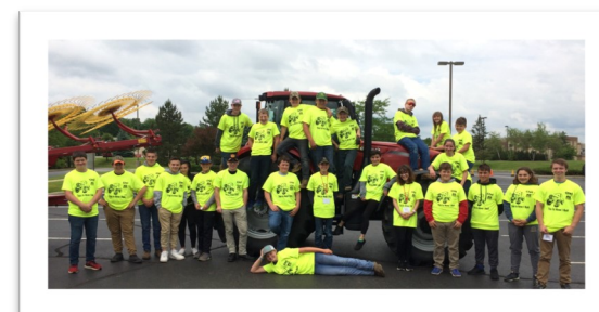
2019 Tractor Safety Participants

Does your son or daughter work on a farm or operate a tractor on public roads? If so, consider enrolling them in the 2020 Youth Tractor Safety Program. Extension's annual program is tentatively scheduled for the week of June 15, 2020 at Burlington High School. The program is open to youth ages 12 to 16 and includes both classroom and hands-on driving instruction. Upon completion, youth will receive a certification allowing them to legally operate machinery on public roads and on farms not owned by a parent/guardian. To receive a notification when registration for the 2020 program opens, please contact Extension Kenosha County.