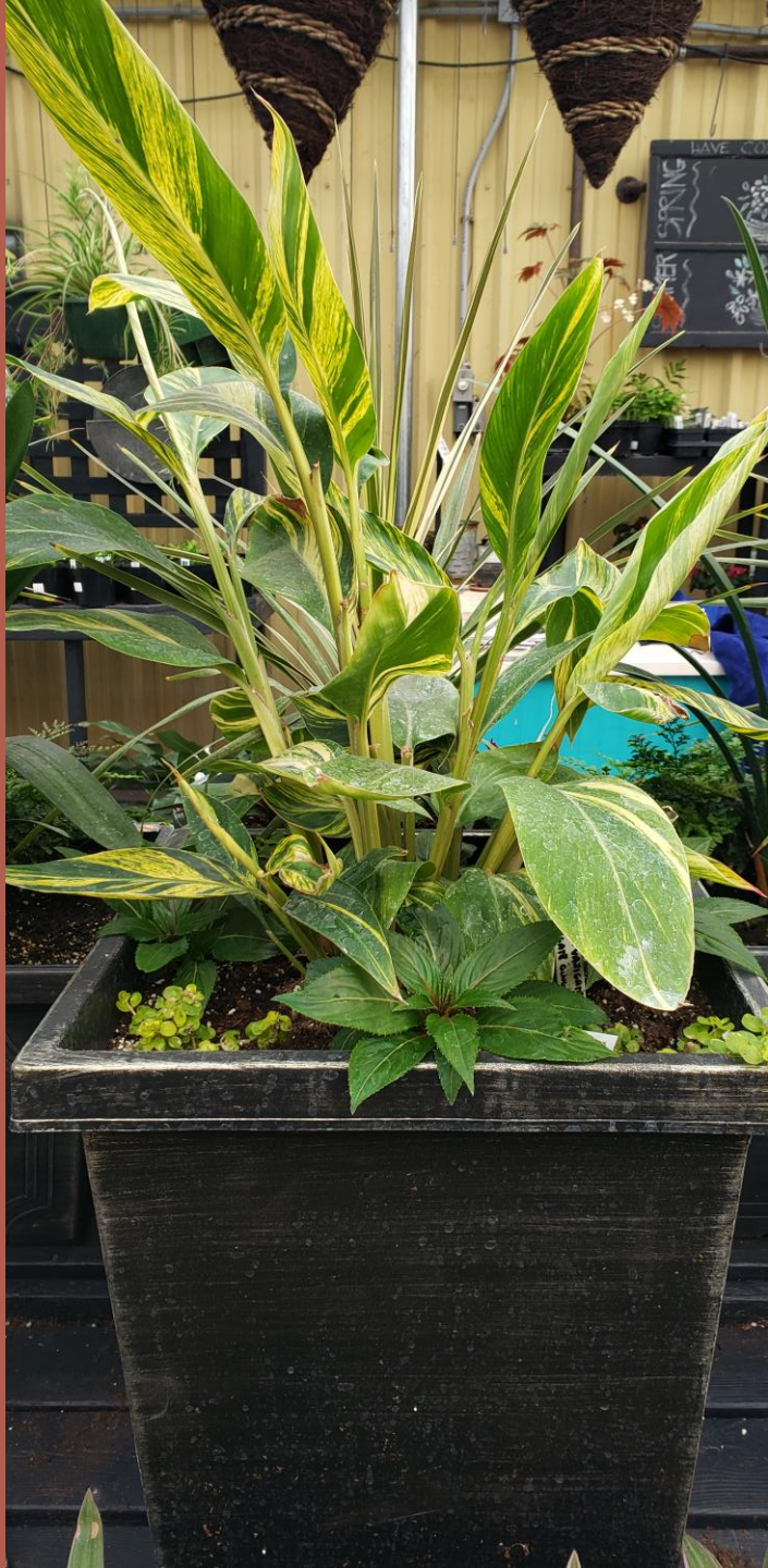
Variegated ginger Torbay dazzler cordyline