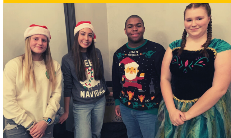
2021 Winter Project, Youth as Resources