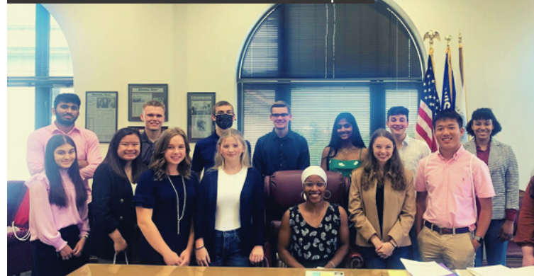
2021-2022 Youth in Governance Participants

For the 2020-2021 program year, the Youth As Resources Board, made up of 9 high school aged youth and three adults, funded 11 service projects for a total disbursement of $5,460.00 in grant funds. In May, 2021, the 2020-21 the Youth As Resources Board was recognized for their service and the 2021-22 Board was sworn in, with two returning Youth Board members and seven new Youth Board members. From September-December, 2021, Youth As Resources funded four service projects for a total disbursement of $1,210.00 in grant funds.