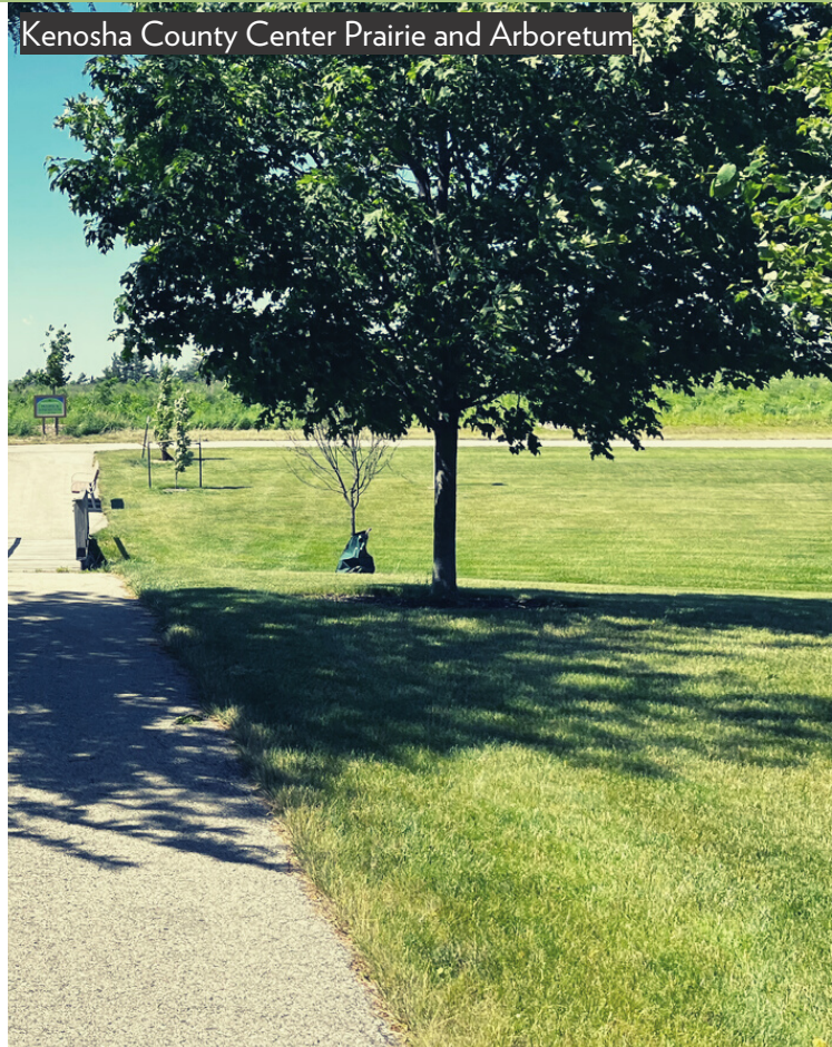
Kenosha County Center Prairie and Arboretum

Mercy Housing in Kenosha provides housing to low income senior citizens, and people with special needs. Extension trained more than 10 residents in raised bed gardening which led to the development of two beds. Because of this programming, nearly 100 pounds of crops were harvested.