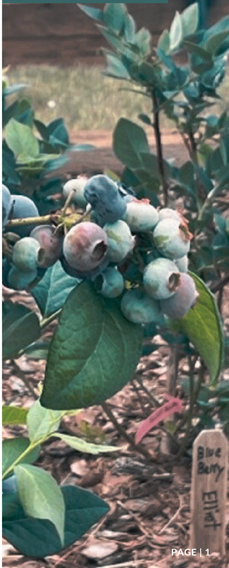
Photo: Antioxidant rich blueberry variety trial performance in raised beds

Residents in Kenosha, Racine, and Milwaukee County participated in the plant health advising program