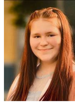
Hera First Vice President